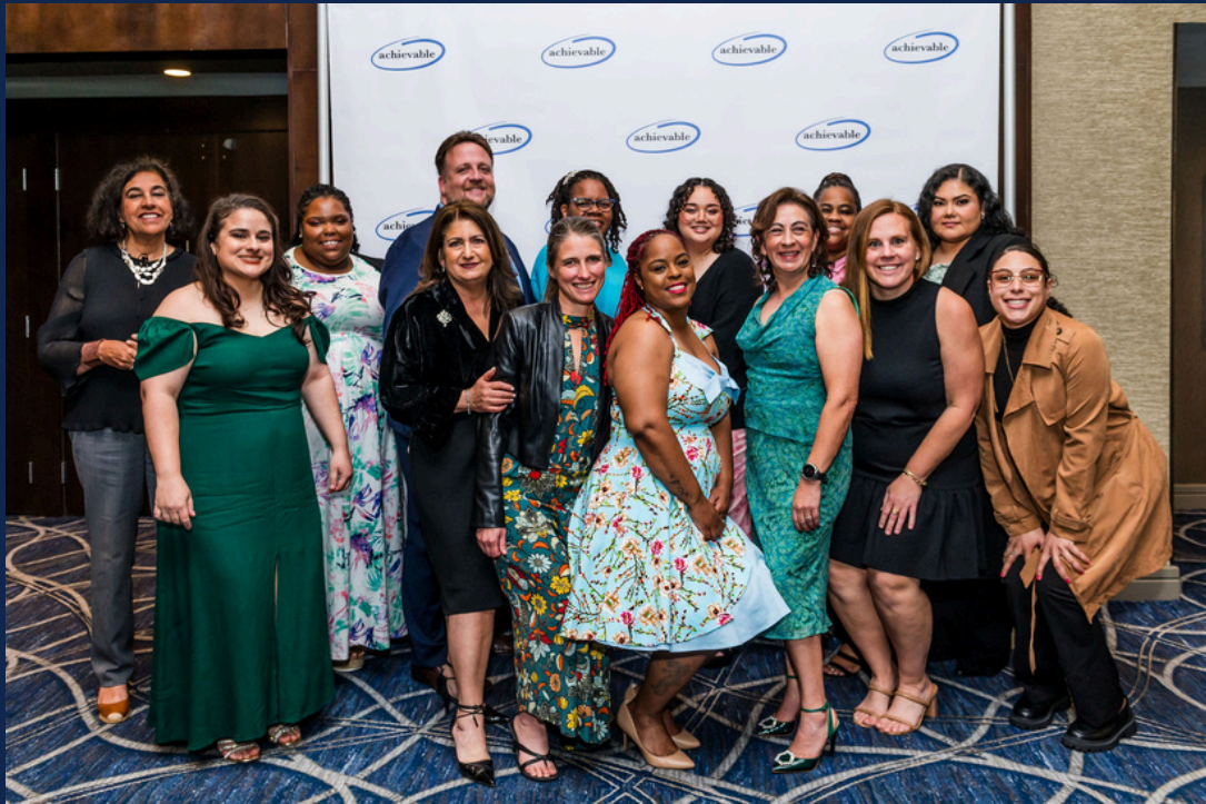
The Achievable Health team celebrates our mission at the the 2024 It's Achievable Gala.