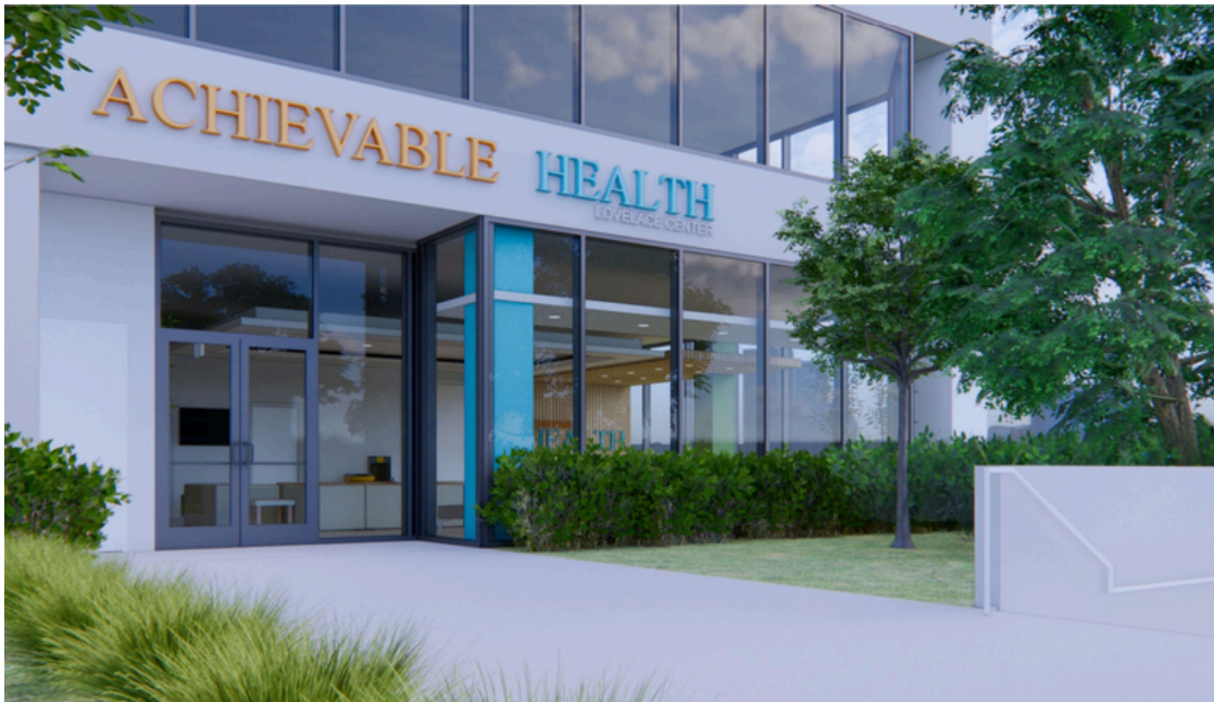
Health center entrance view, architectural rendering

Achievable Health's new home, and the investments made in the expansion of our staff and programs, will allow us to more than double the number of patients served in just three short years.