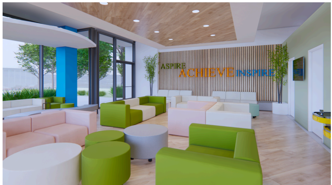
Health center lobby view, architectural rendering